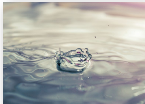
Starting a ripple effect

WATER — Water flows through the Scriptures: the Flood, the Red Sea crossing, water springing from a rock to nourish Israelites in the wilderness, the healing of Naaman’s leprosy when he washed in the Jordan River, John baptizing Jesus and, chiefly, our baptism into Christ. The water of baptism symbolizes cleansing from sin, the quenching of our spiritual thirst and God raising us from death (drowning in sin) to life everlasting. Just as we cannot live without physical water, neither can we truly live without the living water Jesus gives (see John 4:13-14).